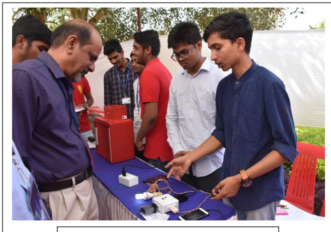
Portable Fridge and Smart Switch

Being held since last five years, PUPA has garnered attention from institutions all over the state. A journey that began with 20 budding ideas in 1 st season in 2013 , has now reached to 414 engineered ideas in its 6 th season . With highest number of registrations up till date, from total 32 institutions , sixth edition of PUPA promised to set up a technical fiesta like never before. These 32 institutions include 4 schools, 3 polytechnic colleges, 5 MBA institutions, 2 PU colleges and 16 engineering institutions from across of North Karnataka. Each team was given a seed capital of Rs. 500 from KLE Tech Univ.