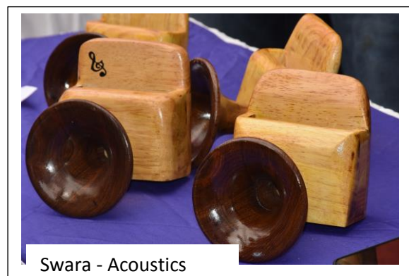
Swara - Acoustics

Fans of the gaming sensation PUBG also had something to take away. PUBG trigger , which emphasized the shooting and focusing experience in game, emerged as the centre of attraction. Cool Buzz , a mini portable refrigerator which helps travellers and hostellers, worked on pie electric module with a DC power.