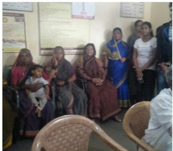
Village walk- Uppinabetageri and Devarahubballi