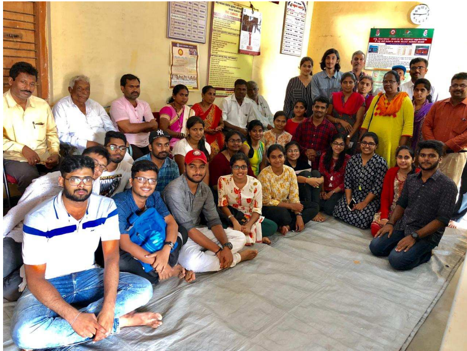
Interaction with the Gram Panchayat, Devarahuballi