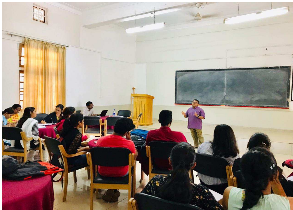
Session with the members of Swami Vivekananda Youth Movement, KLE Tech University