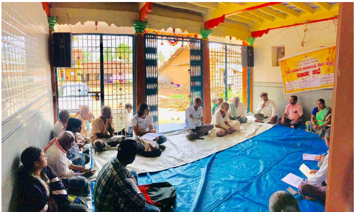
Interaction with the Gram Panchayat, Devarahuballi

At the end of this phase the student teams are ready with the list of co-generated problems of the community they have studied. The assessment was based on the uniquely designed rubrics.